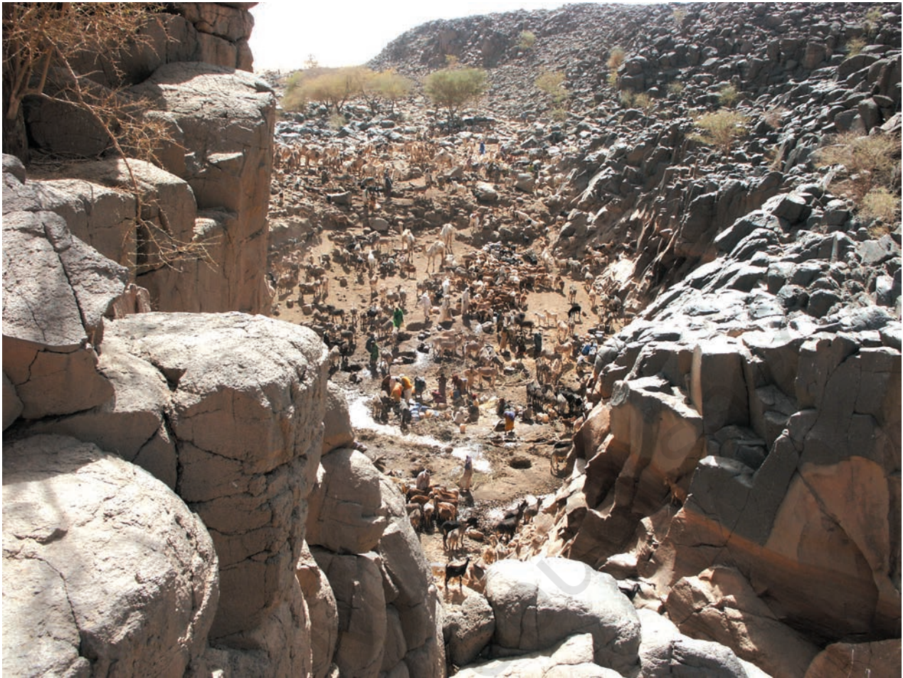
One of the biggest catastrophes in Africa in the 1970s, a drought turned the best cropland in five countries into cracked and barren earth. In fact, the term environmental refugees came into popular vocabulary after this. Many had to flee their homelands as agriculture was no longer possible.

basis of vague scientific evidence and time frames. In that sense the discovery of the ozone hole over the Antarctic in the mid-1980s revealed the opportunity as well as dangers inherent in tackling global environmental problems.