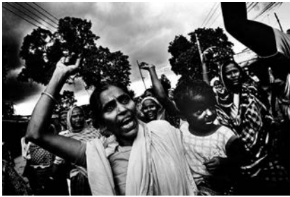
An entire community erupted in protests against a proposed open-cast coal mine project in Phulbari town, in the North-West district of Dinajpur, Bangladesh. Here several dozen women, one with her infant child, are chanting slogans against the proposed coal mine project in 2006.

are now being re-opened to MNCs through the liberalisation of the global economy. The mineral industry's extraction of earth, its use of chemicals, its pollution of waterways and land,