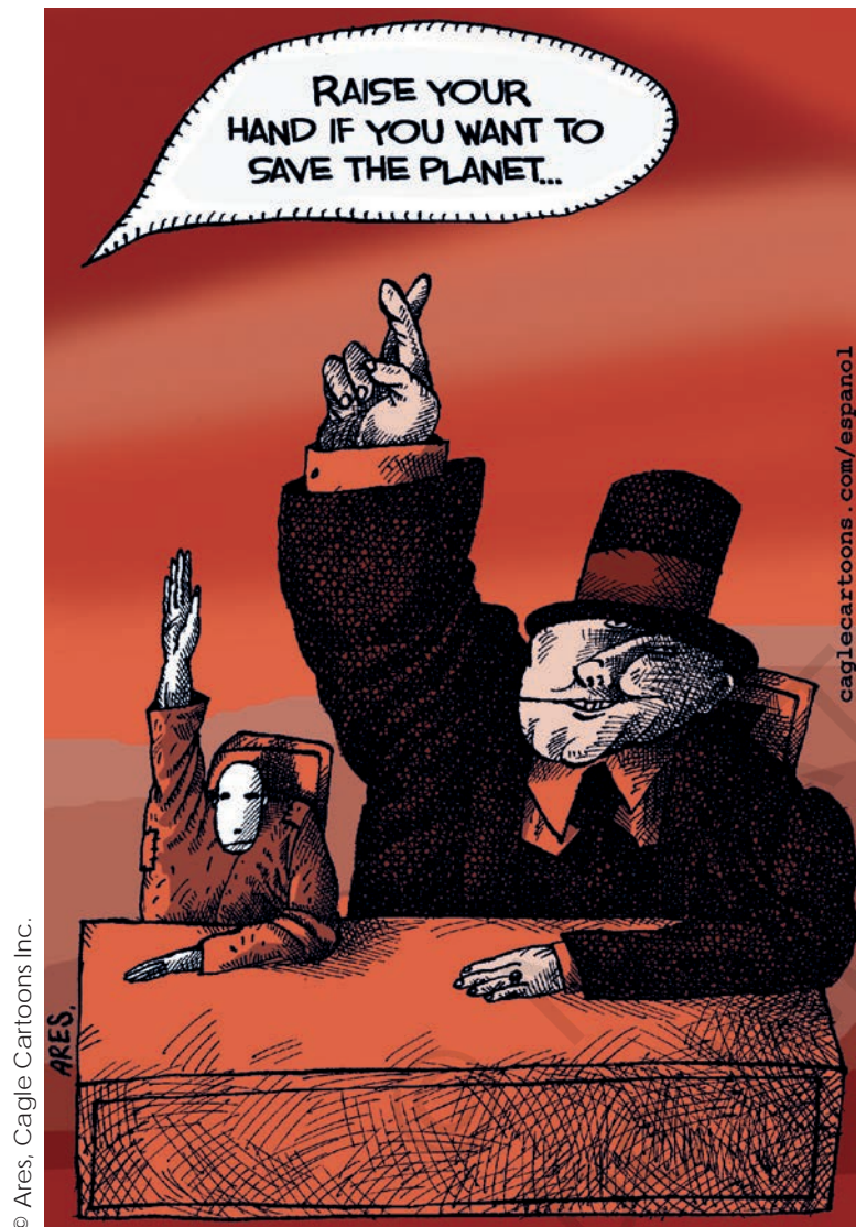
Are there different perspectives from which the rich and the poor countries agree to protect the Earth?

attended by 170 states, thousands of NGOs and many multinational corporations. Five years earlier, the 1987 Brundtland Report, Our Common Future , had warned that traditional patterns of economic growth were not sustainable in the long term, especially in view of the demands of the South for further industrial development. What was obvious at the Rio Summit was that the rich and developed