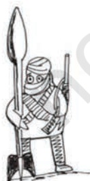
Errorists Loose cannonballs

Toppleton defends freedom and democracy. That's why he is so generous with guns and missiles. Like the ones he gave us to fight the invading Ruffians. He even trained us. We did not realise that it was the oil they were after. Bigoil is always trying to woo us. But we are too busy playing war games. Now we have rules of our own.