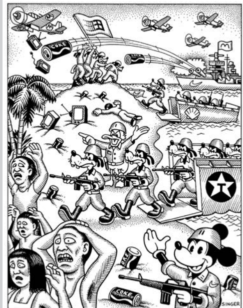
Invading new markets

Make a list of products of multinational companies (MNCs) that are used by you or your family.