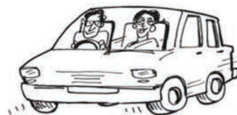
Mr & Mrs Gobbledoo

A new beauty is parked outside our garage. Awesome! Isn't it?...sleek chrome finish, power steering, automatic gears. Excellent pick up and great mileage too. It is low on emissions too...gentle on the atmosphere, you know. Global warming and all that stuff. Now we really are in hurry to zoom off and lead the good life...God Save Everyone!...vrrrooommmmm