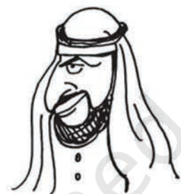
Sheikh Petrodollah King of the land of Black Gold

I value precious things. Bigoil says his President values freedom and democracy. So I keep both safely under lock and key in my land.